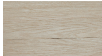
NATURAL OAK (board)