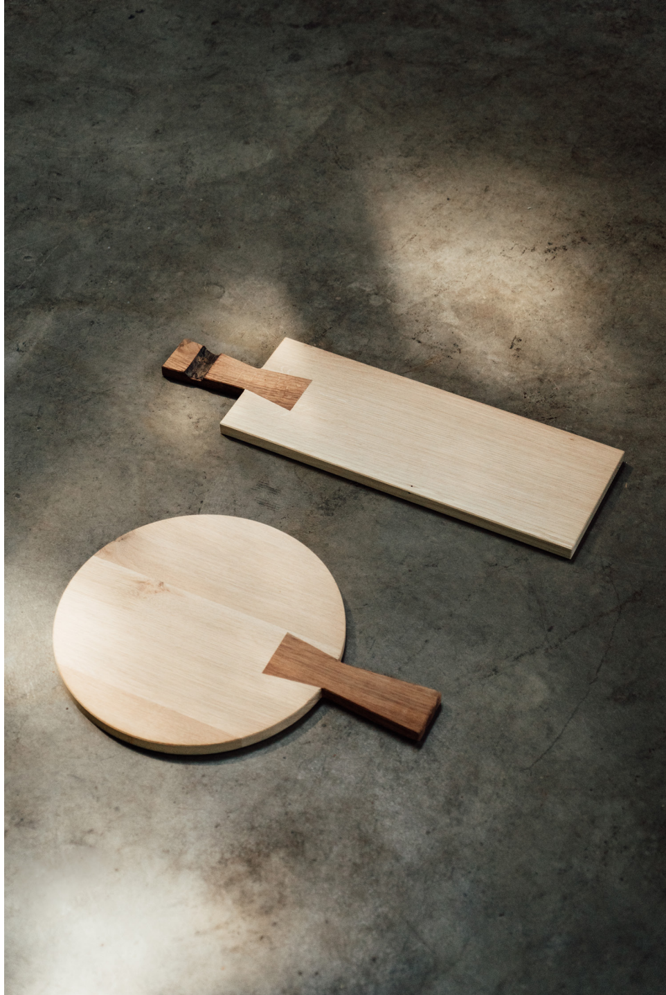
Brad Board by Rohdesign Studio