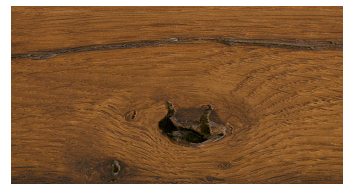
RECLAIMED OAK (handle)