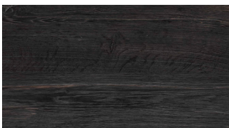
BLACK BURNED+ OILED OAK