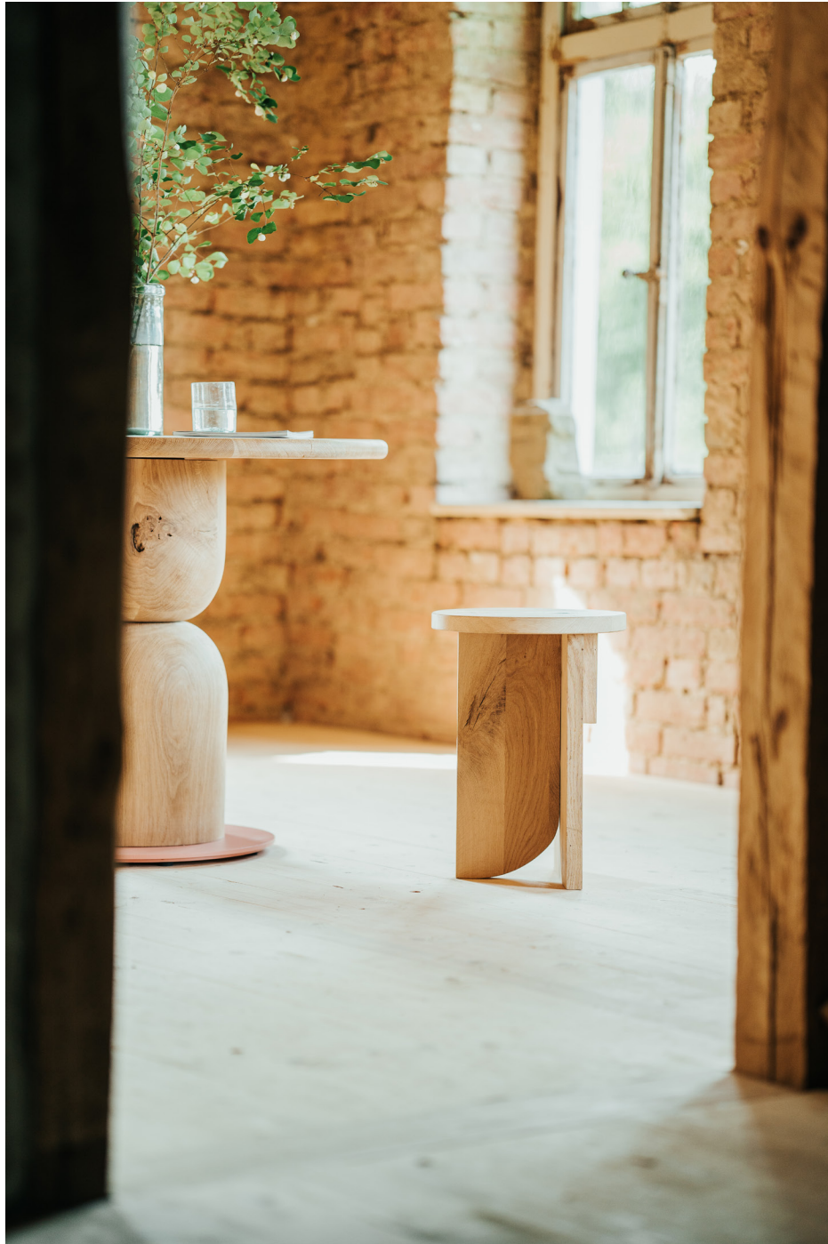
Tibu Stool by Rohdesign Studio